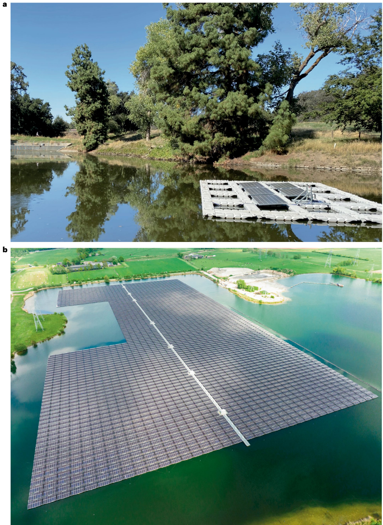
Fig. 3 | Examples of floating photovoltaics. a, A floating photovoltaic system around the University of California at Davis designed to reduce green algae by improving aeration with solar energy. b, A floating solar farm producing clean renewable electricity energy and reducing reservoir evaporation in Flevoland, the Netherlands.